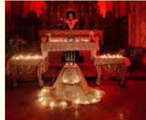
Radiant welcome to the Lord's embrace at the Taize service.

On 22 nd September the St. Catherine of Alexandria's parish youth gathered together for a deeply enriching spiritual experience. The event began with a solemn Taize prayer service, held in the Blessed Sacrament. This meditative prayer service allowed the participants to reflect, pray and connect spiritually. After the prayer service followed a series of fun games which sparked laughter and fostered team spirit amongst the Parish Youth. The event concluded with a shared delicious meal. 'Communo' reminded us that church is not just a place for worship but also a home where friendships are nurtured, and faith is lived out together.