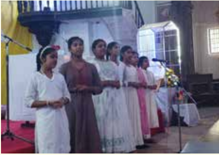
Beautiful prayer dance dedicated to Our Mama Mary

disachea Porbek Misache bhettek vinchun kaddlolo vixoi “Marie Bhaxen Sonvsarak Jezu dium-ia” hacher adharun, zaito bhor ghalun, Ankvar Mariek man diunk bharim vavurlim ani orthabhorit sevadhorm toiar kelo. Coxo porim amcheanim sonvsarak Jezu diunk zata tem dolleam mukhar dovorlem.