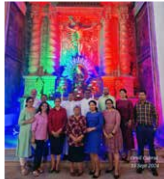
St Augustine ward members at the altar of Our Lady of Sorrows.