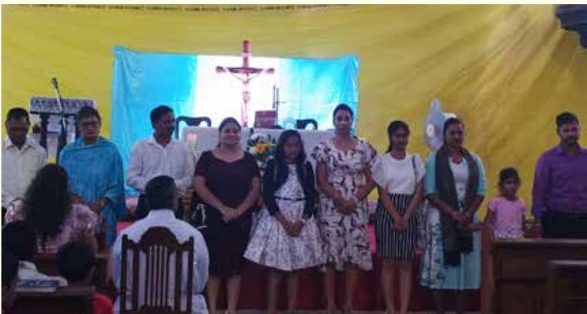
Mother - A role Model