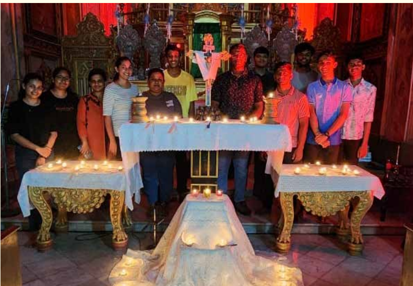
We glow in His light –Joy-filled youth after the Taize Prayer Service