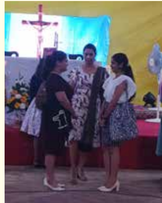
A mother motivating her daughter