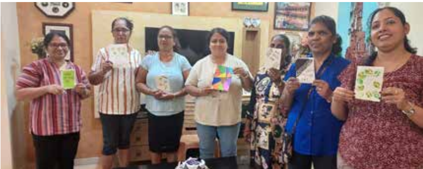
Happy Mother's of St Joseph Vaz Somudai.

To conclude in the words of Pope Francis, "To be a mother is a great treasure. Mothers in their unconditional and sacrificial love for their children, are the antidote to individualism; they are the greatest enemies against war."