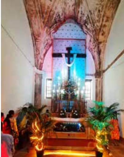
The Power of the Miraculous Cross. We Adore Thee Oh Lord!